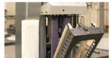
Maintenance free carriage