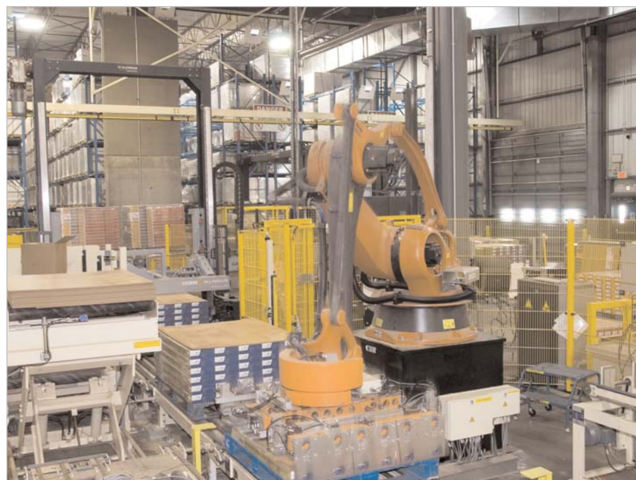
A robotic palletizer from KUKA Robotics can stack many different heights and patterns as per client needs.