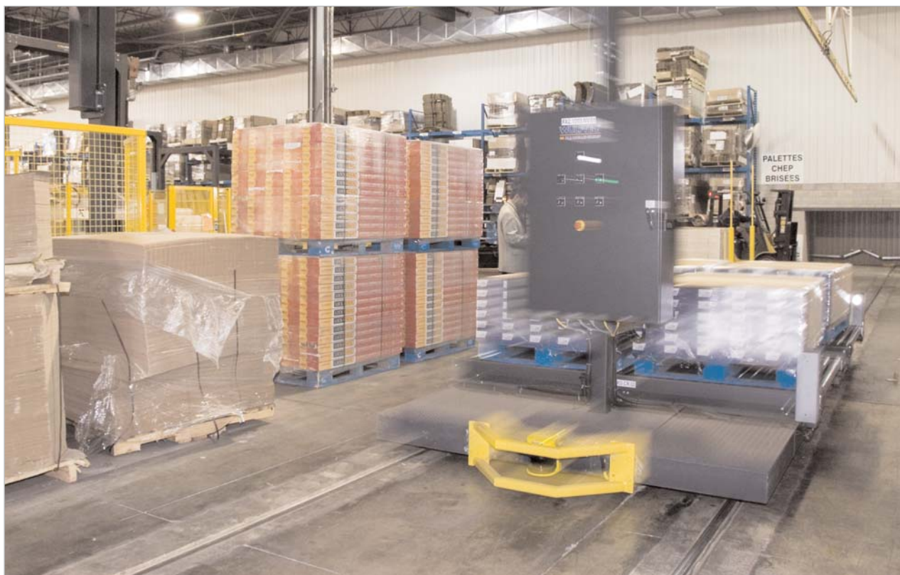
At Uniboard’s Laval plant, a fully-automatic electric transport system, designed and installed by Wulftec, runs newly-manufactured laminate flooring from the two milling lines to the plant’s warehousing/shipping area.

“And that’s not just something we say: we put our foot down, right onto our laminate flooring, to show that we really mean it.” □