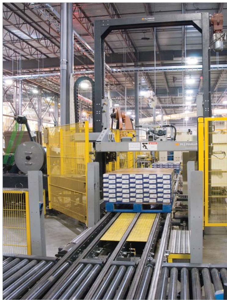
Boasting up to 2,000-pound compression force, the Vario Master 9461 strapper applies polyester banding to secure palletized loads of laminated flooring board sheets.

“So we supplied Uniboard with two stations, one for each line, that included a special label printer-applicator for the large, seven-by-seventeen-inches labels, as well as a more standard label applicator for applying and centering standard, pre-printed labels on the side of the load.”