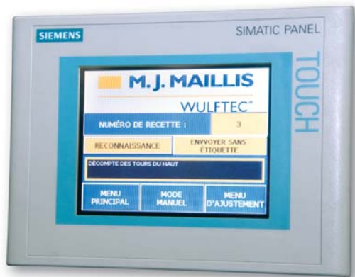
The Simatic Panel touchscreen interface from Siemens facilitates user-friendly operation of the Wulftec end-of-line packaging equipment installed at the Laval plant.

“The loads are required to have two labels automatically applied, with one of these being a very large label that needed to be corner-applied—half of a label on each side of the load,” explains Pelletier.