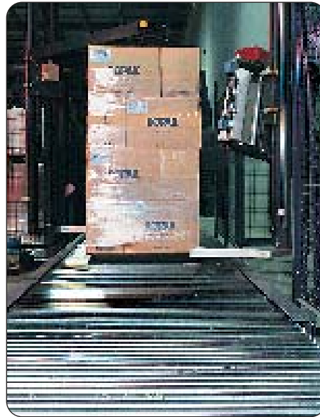
The Wulftec Tornado 200 stretchwrapper achieves throughput speeds of 60 loads per hour.

“The Pop-Up was needed because we don’t necessarily use wooden pallets with our loads,” says Samlalsingh. “The system is designed to work with or without pallets, and typically, we don’t use them for cleanliness purposes. With wooden pallets, you can get wood chips and dirt accumulating everywhere.” □