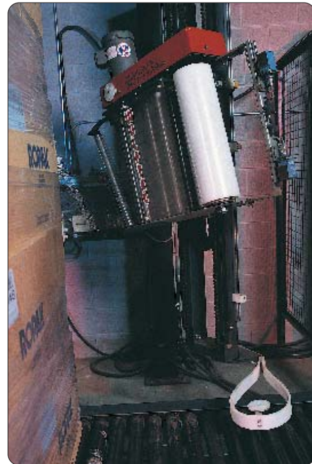
The Wulftec Tornado 200 installed at the Ropak plant in Oakville has several custom built-in features that allow it to optimize load stability and virtually dispense with the use of wooden pallets altogether.

Inc. , based in nearby Mississauga, Ont.